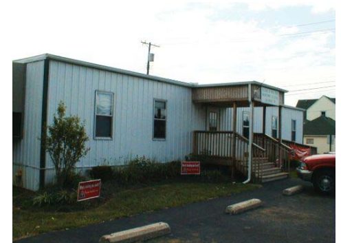
New Rome's "Trailer of Injustice"

New Rome's majority council members have appointed each other without a formal election since 1979.